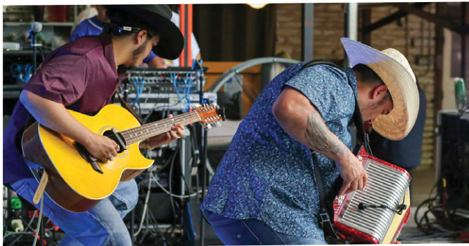
Rancho Alegre Conjunto Music Festival

Amplify saved the Rancho Alegre Conjunto Music Festival.