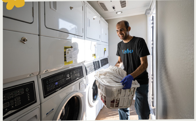
Volunteer at Mission Accomplished

Since its inception in 2016, the I Live Here I Give Here Amplify Fund (Amplify Fund) has given back nearly $12 million to nonprofits. It supports every participating nonprofit and is distributed proportionately across over 700 organizations. In addition to providing prizes and matching gifts, The Amplify Fund helps to reimburse nonprofits for their costs to fundraise on Amplify Austin Day, making this campaign a cost-effective way to fundraise.