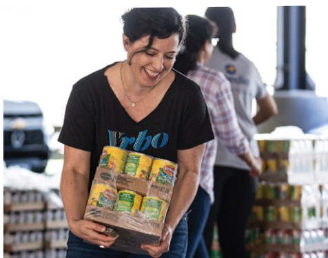
Volunteer at Meals on Wheels

Large company 500+ employees: Cirrus Logic