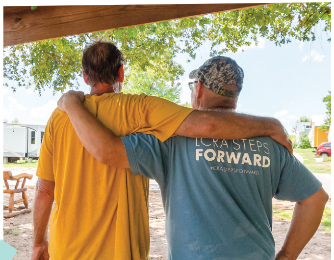
Mobile Loaves and Fishes

We participate in Amplify Austin Day, because we believe that housing alone will never solve homelessness, but community will. When our community comes together to achieve our mission of mitigating homelessness, there is a huge impact on our formerly homeless neighbors. Amplify Austin has helped Mobile Loaves & Fishes connect with our community over the 24-hour period of giving. We enjoy knowing that everyone has the opportunity to be involved in this mission of providing food and clothing, cultivating community, and promoting dignity to our formerly homeless neighbors in need.