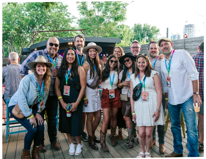
A group of VIP Attendees enjoying the beautiful spring weather from the VIP patio.