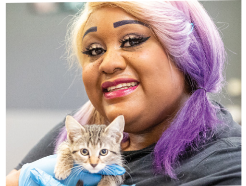
Volunteer at Austin Humane Society