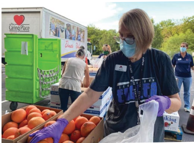
A volunteer at The Caring Place

Providing basic human needs to the city of Georgetown and surrounding areas is The Caring Place's specialty. They have a knack for bringing together their community for good. Through Amplify Austin Day, they raised enough funds to support over 1500 families fleeing domestic abuse by providing a safe place to spend the night.