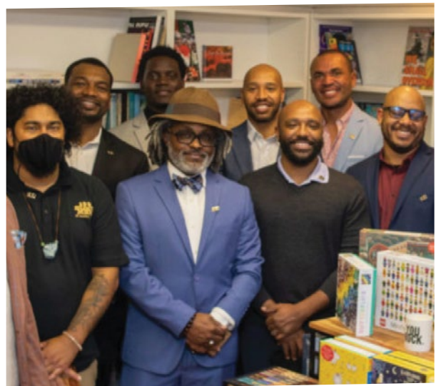
Participating Amplify Austin Day Nonprofit, 100 Black Men of Austin

AmplifyATX.org. We expanded our site functions to allow users to search for BIPoC-Led social change organizations and nonprofits who have adopted a racial equity statement. Together our community gifted $1.2 Million to 139 BIPoC-Led nonprofits. We were proud to see the overwhelmingly positive response to this important work and are encouraged to expand our impact to the local BIPoC community.