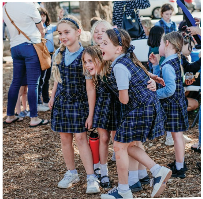
Girls playing at Valor Public Schools' Amplify Austin Day event