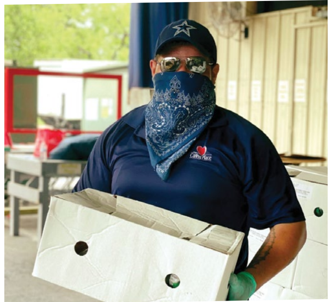
A volunteer at The Caring Place