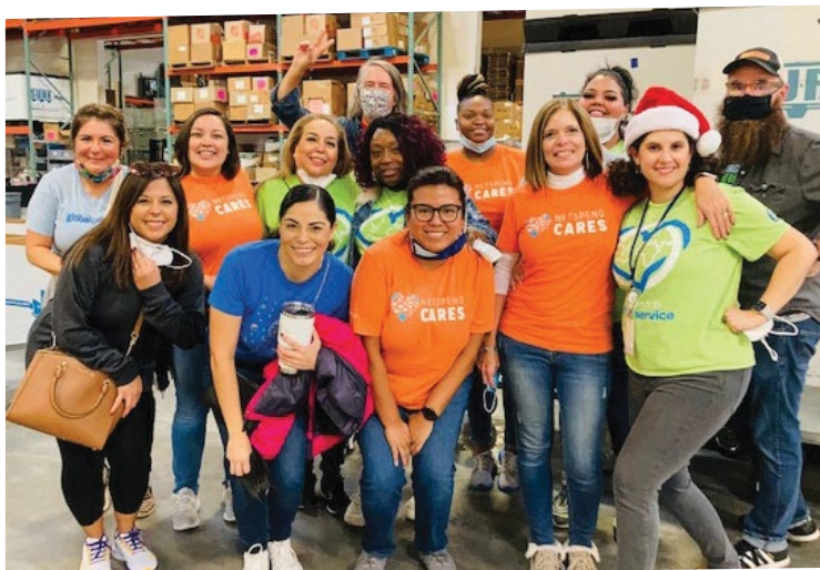
Netspend team members volunteering with Blue Santa

Large company 500+ employees: UFCU | 31%