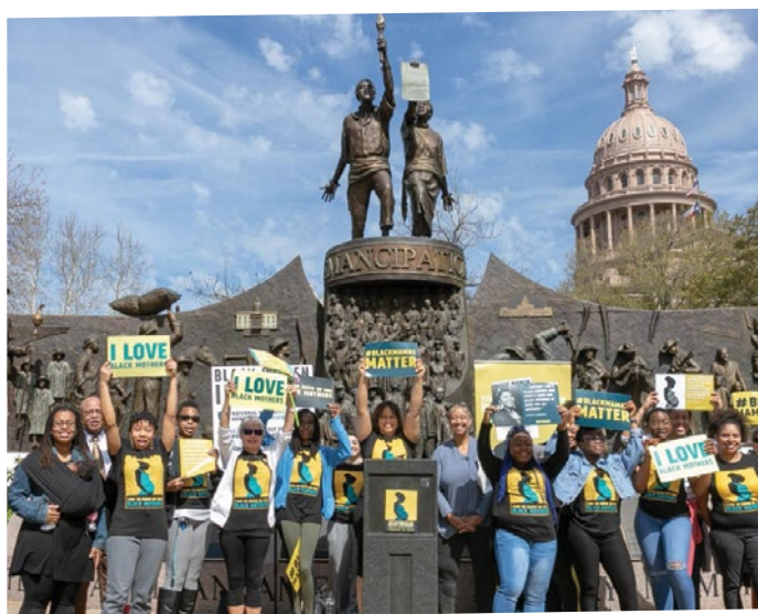
Black Mamas ATX at the Texas African American History Memorial

To meet their mission, the team rallied the Austin community for support. They saw a great response from not only their former clients but new faces as well. Because of funds raised on Amplify Austin Day, Black Mamas ATX can provide 1-on-1 birth education classes to 139 expectant mothers.