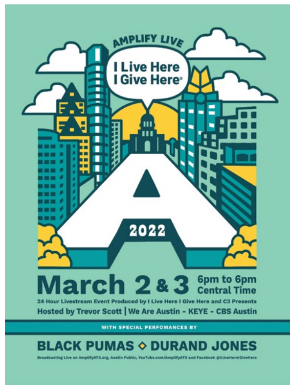
Poster for Amplify LIVE