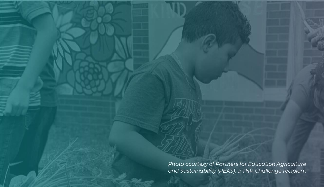
Photo courtesy of Partners for Education Agriculture and Sustainability (PEAS), a TNP Challenge recipient

TRUTH BE TOLD REGINA MATER HEADWATERS SCHOOL TOP THREE TNP CHALLENGE MATCHING GIFT RECIPIENTS